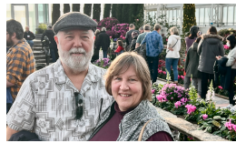
CONTINUATION HOLIDAY TRADITION OF VISITING COMO PARK CONSERVATORY