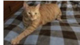
MORRIS THE CAT THIS SOLID TWO- YEAR-OLD LOVES TO PLAY FETCH!