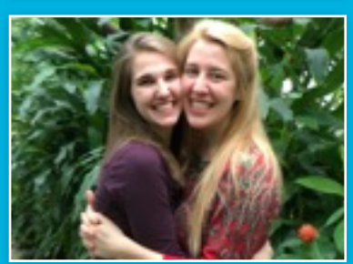
2015 in a Flash: (top to bottom) Corpus Christi vacation [3/10]; dinner with Rick's dad [8/10]; with Rick's mom [8/14]; Thanksgiving in Colorado with Matt's mom [11/27]; our girls at Como Park Conservatory, a Christmas tradition [12/24].